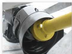
Splined input shaft Slip clutch Standard.