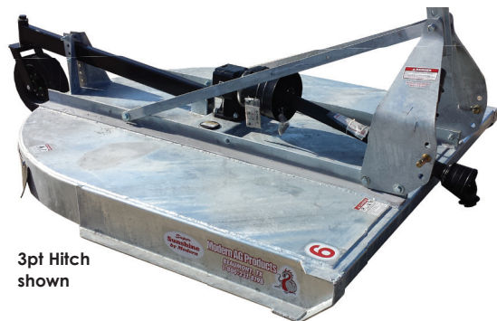
3pt Hitch shown