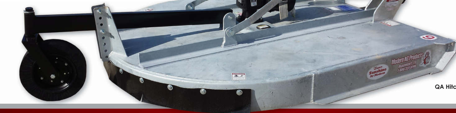
QA Hitch shown