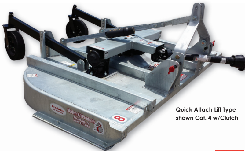
Quick Attach Lift Type shown Cat. 4 w/Clutch